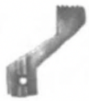
CHAINING FEED DOG #39505E