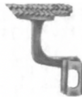
DIFFERENTIAL FEED DOG #39526P