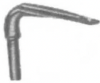
UPPER LOOPER #39508A