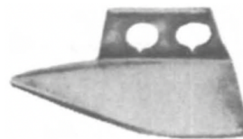
FABRIC GUARD #39578R