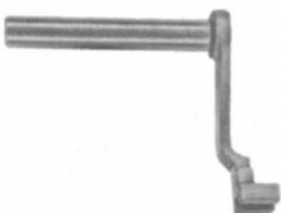
UPPER KNIFE DRIVING ARM #39573H