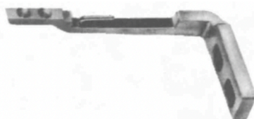
FABRIC GUARD MOUNTING BRACKET #39578P