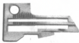
THROAT PLATE #39524V3/32 (#39524B3/32) 3/32" Gauge