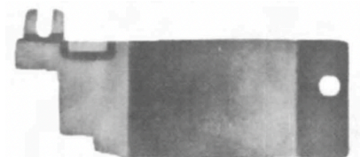
CHIP GUARD #39578U